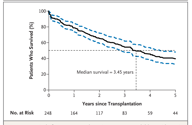
Figure 1. Survival after Lung Transplantation among 248 Children with Cystic Fibrosis Who Were Younger than 18 Years of Age.

To facilitate interpretation, we recoded interaction terms to isolate effects before and after transplantation, thus revealing how covariate effects changed with this procedure (Table 2).<sup>12,13</sup> Older age at study entry was associated with improved survival before transplantation but decreased survival after transplantation. Diabetes in patients before study entry was associated with reduced survival before transplantation but was not significantly associated with survival after transplantation. Staphylococcus aureus infection was