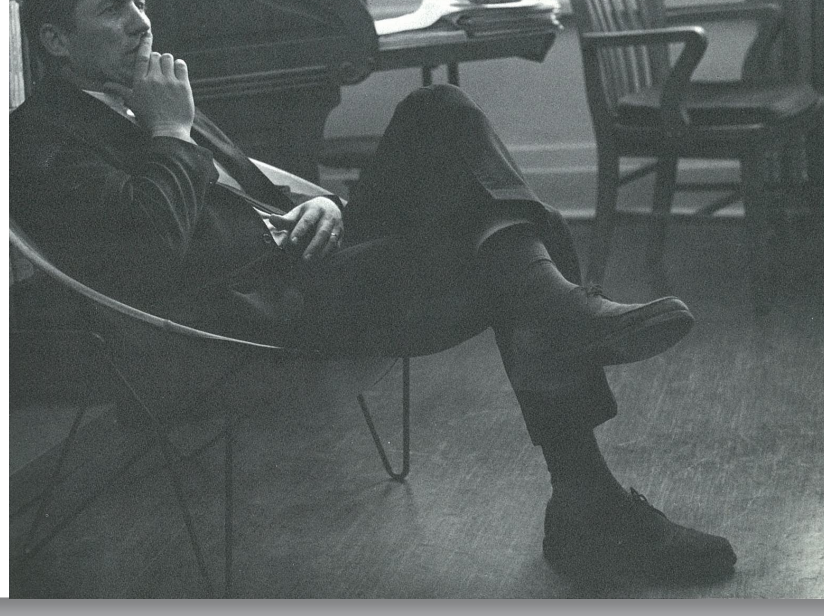
Undergrad Spotlight page 7