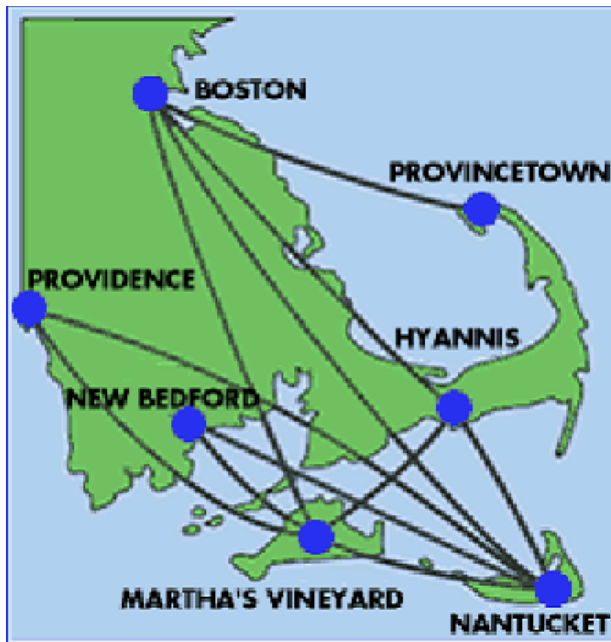
Figure 2: Northern Route Map for Cape Air -- May 2001

Some natural questions arise about graphs. It might be important to know if two vertices are connected by a sequence of two edges, even if they are not connected by a single edge. In Figure 1, A and C are connected by a two-edge sequence (actually, there are four distinct ways to go from A to C in two steps).