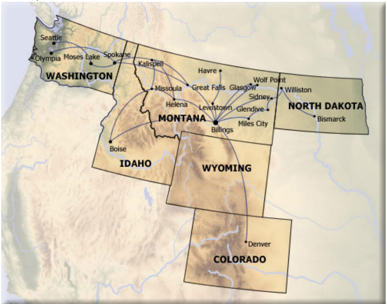
Figure 3: Northern Route Map for Big Sky Airlines -- 2003

The route map for the northern routes of Big Sky Airlines for 2003 is given in Figure 3 below. Produce an adjacency matrix for this map. The airline ceased operations in 2008, so updated route maps don't exist.