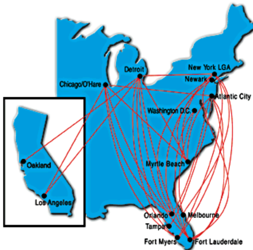
Figure 4: Route Map for Spirit Air -- May 2001

Figure 4 shows the May 2001 route map for Spirit Airlines. An updated map for 2015 may be found at https://www.spirit.com/routemaps.aspx . The adjacency matrix for the map in Figure 4 is the matrix A which is found below. The vertices correspond to: Atlantic City, Chicago (O'Hare), Detroit, Fort Lauderdale, Fort Myers, Los Angeles, Melbourne, Myrtle Beach, Newark, New York (LaGuardia), Oakland, Orlando, Tampa, and Washington (Reagan National). What is the shortest number of flights it would take to go from Tampa to Newark? How many different ways can you make that trip?