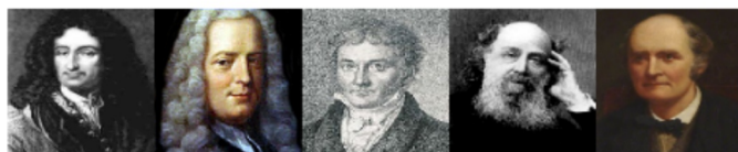
Leibniz, Gottfried Cramer, Gabriel Gauss, Carl Friedrich Sylvester, James J. Cayley, Arthur