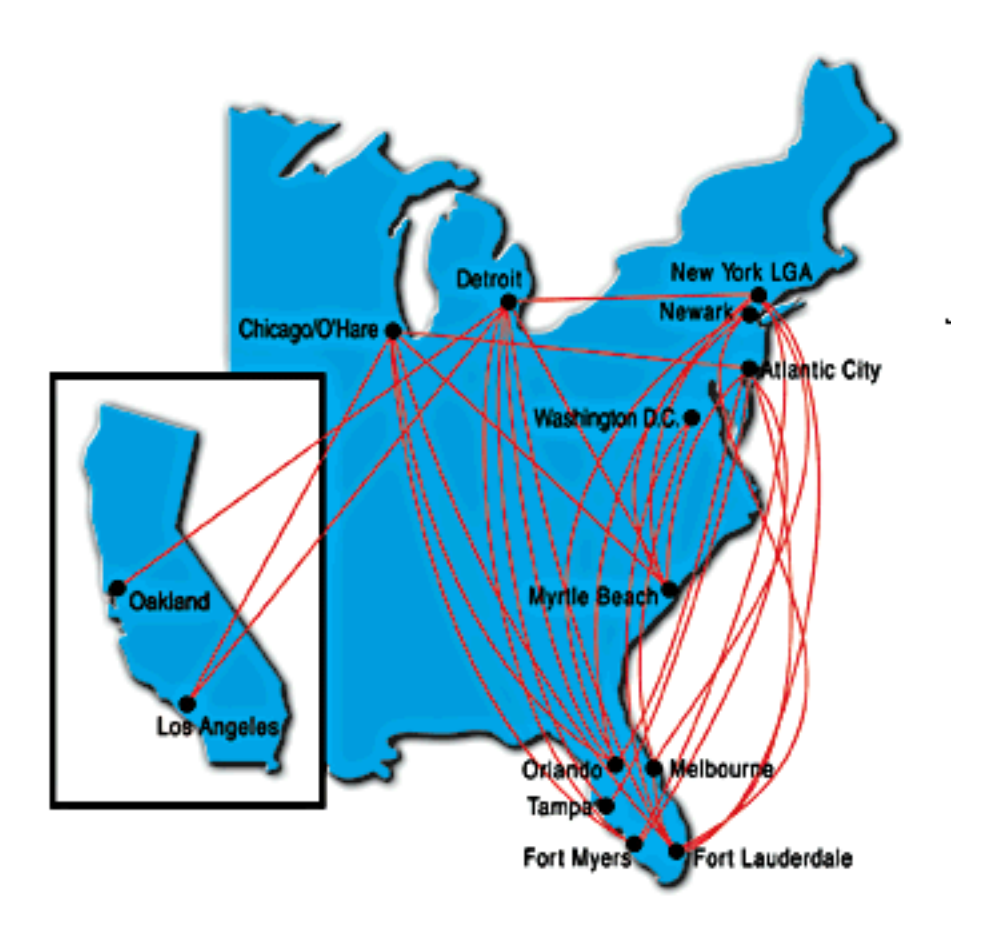
Figure 4: Route Map for Spirit Air -- May 2001 The Maple command to create the adjacency matrix for Spirit Airlines is A := < < 0, 1, 0, 1, 1, 0, 0, 1, 0, 0, 0, 1, 1, 0>

Figure 4 shows the May 2001 route map for Spirit Airlines. An updated map for 2015 may be found at https://www.spirit.com/routemaps.aspx. The adjacency matrix for the map in Figure 4 is the matrix A which is found below. The vertices correspond to: Atlantic City, Chicago (O'Hare), Detroit, Fort Lauderdale, Fort Myers, Los Angeles, Melbourne, Myrtle Beach, Newark, New York (LaGuardia), Oakland, Orlando, Tampa, and Washington (Reagan National). What is the shortest number of flights it would take to go from Tampa to Newark? How many different ways can you make that trip?