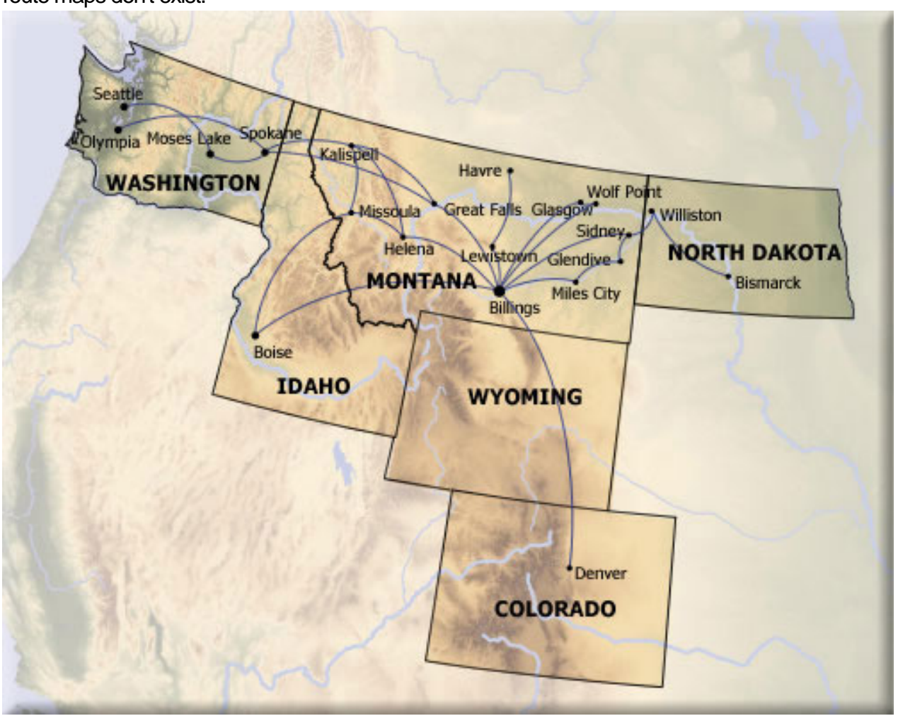
Figure 3: Northern Route Map for Big Sky Airlines -- 2003

The route map for the northern routes of Big Sky Airlines for 2003 is given in Figure 3 below. Produce an adjacency matrix for this map. The airline ceased operations in 2008, so updated route maps don't exist.