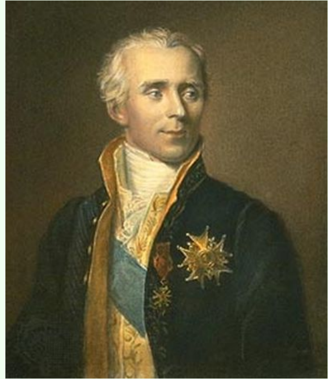
Pierre-Simon Laplace (1749-1827)