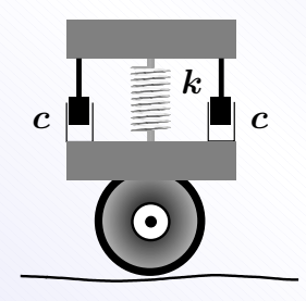
Figure 6. A trailer strut with dampeners on a washboard road

An auto tows a one—wheel trailer over a washboard road. Shown in Figure 6 is the trailer strut, which has a single coil spring and two dampeners. The mass m includes the trailer and the bicycles.